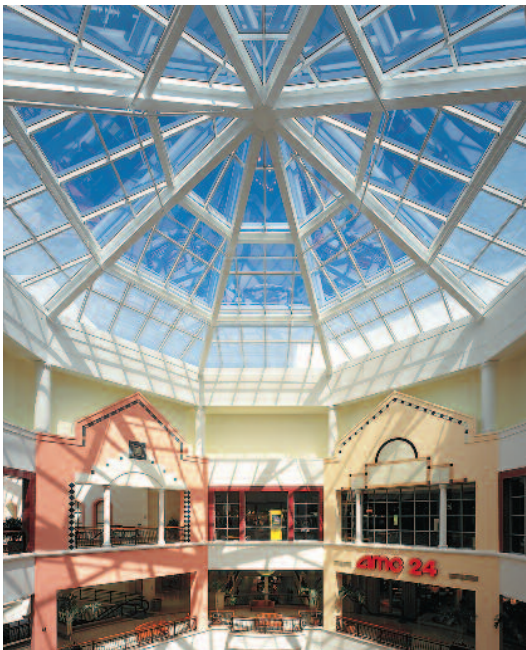
Aventura Mall, Aventura, FL Architect: RTKL Associates

This Multi-Hazard (MH) version of the BMS-3000 skylight system was developed for high velocity hurricane regions and antiterrorism or bomb-blast resistant applications using laminated insulating glass infills. The MH system utilizes snap-on glazing caps to conceal the stainless steel glazing fasteners, similar to the SG system, and is thermally broken to reduce heat transfer. The BMS-3000 MH system incorporates deeper glazing rabbets for increased glass coverage and structural silicone applications to meet the Department of Defense (DoD) antiterrorism standards for buildings as contained in their Unified Facilities Criteria (UFC). The MH version can be designed for higher, project-specific blast loads using dynamic analyses.