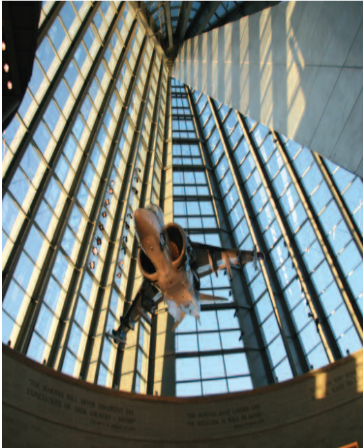
National Museum of the Marine Corps, Triangle, VA Architect: Fentress Bradburn Architects

The Screw-Glazed (SG) version of the BMS-3000 system was developed for high, negative wind load conditions and hurricane exposures . The SG version also was created for projects where certain glazing consultants preferred a pressure-wall system utilizing stainless steel glazing fasteners, versus the thermally broken glazing clips of the standard BMS system. The SG system employs the same rabbet and guttering system used in the standard BMS-3000 system and is available with fully captured, two-sided and four-sided structural silicone glazing options. The SG system has been subjected to extensive AAMA and ASTM International air, static and dynamic water and structural load testing, as well as NFRC and AAMA 1503 thermal testing.