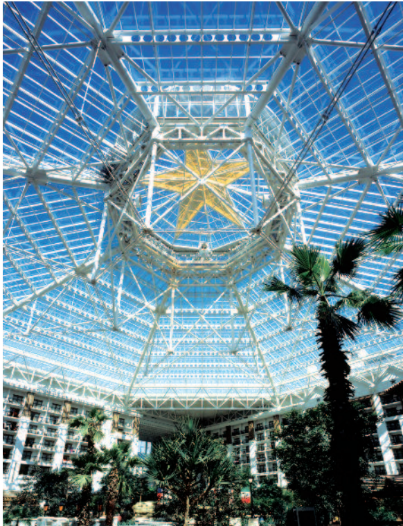
Gaylord Texan Resort & Convention Center, Grapevine, TX Architect: Hnedak Bobo Group, Inc.